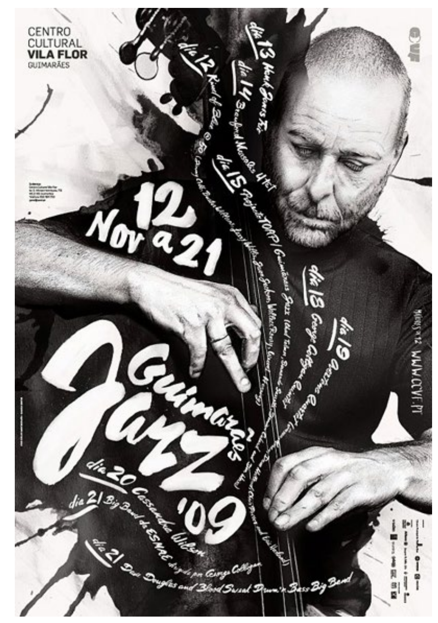
FIGURE 2: Example of type hierarchy in a poster, <u>http://denielleemans.com/creating-hierarchy/</u>. The viewer's eye is first drawn to the typographic event title, then to the date range, and last to the specific daily events. This doesn't even take into account the motion and energy of the text mixed with the imagery.

• Handout 4D.1_Guide to Font Pairing.pdf