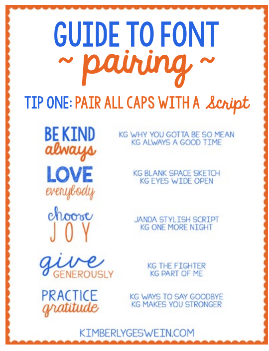
FIGURE 5: One page of Handout 4D.1_Guide to Font Pairing.pdf

Have students test out font combinations from the Handout 4D.1_Guide to Font Pairing.pdf for inspiration. Provide printouts of the complete font sets for students to cut out and use with their poems. If technology is available, this assignment may be done digitally. Fonts can be downloaded for free from <u>Kimberly</u>. <u>Geswein's site</u>. Ask students to try the following combinations of font styles with parts of their poems: